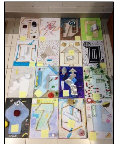
Finished Golf Holes