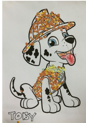
Untitled By Toby Hartono