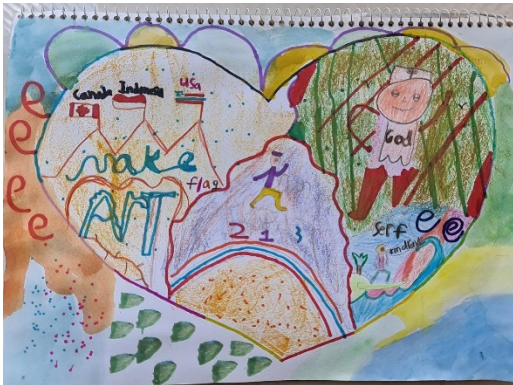
Untitled By David Oh