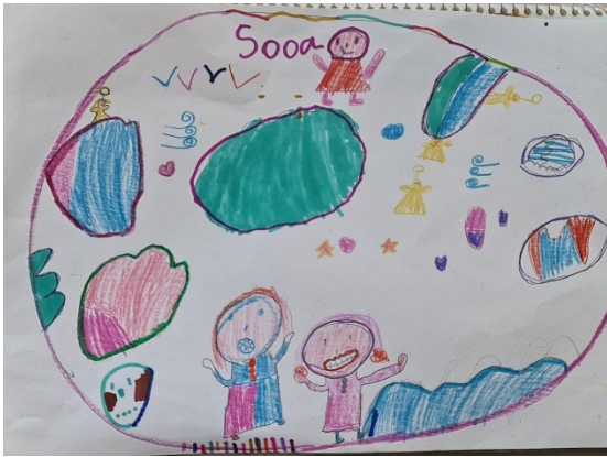
Untitled By Soo A Oh